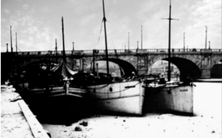
Above: Frozen solid at Kingston Bridge Boatyard in the winter of 1963/64.

Britain. Temperatures rose rapidly and the sudden thaw caused the river to overflow. Similar flooding has occurred since, notably in September 1968 when the River Mole and its tributaries dumped huge quantities of water into the Thames at Hampton Court and in 2014 when the Jubilee River caused serious flooding in Shepperton and the stretches below.