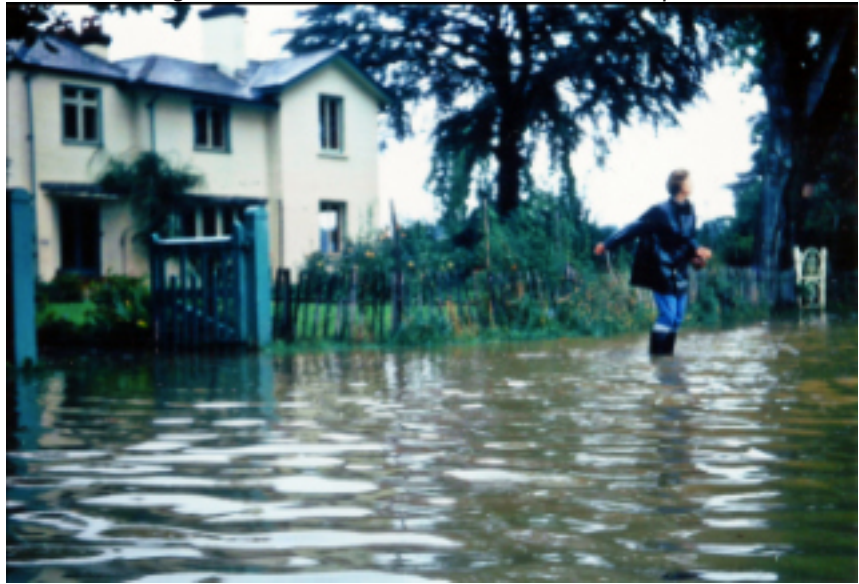
Below: Feeding the ducks outside The Wilderness in September 1968

Britain. Temperatures rose rapidly and the sudden thaw caused the river to overflow. Similar flooding has occurred since, notably in September 1968 when the River Mole and its tributaries dumped huge quantities of water into the Thames at Hampton Court and in 2014 when the Jubilee River caused serious flooding in Shepperton and the stretches below.