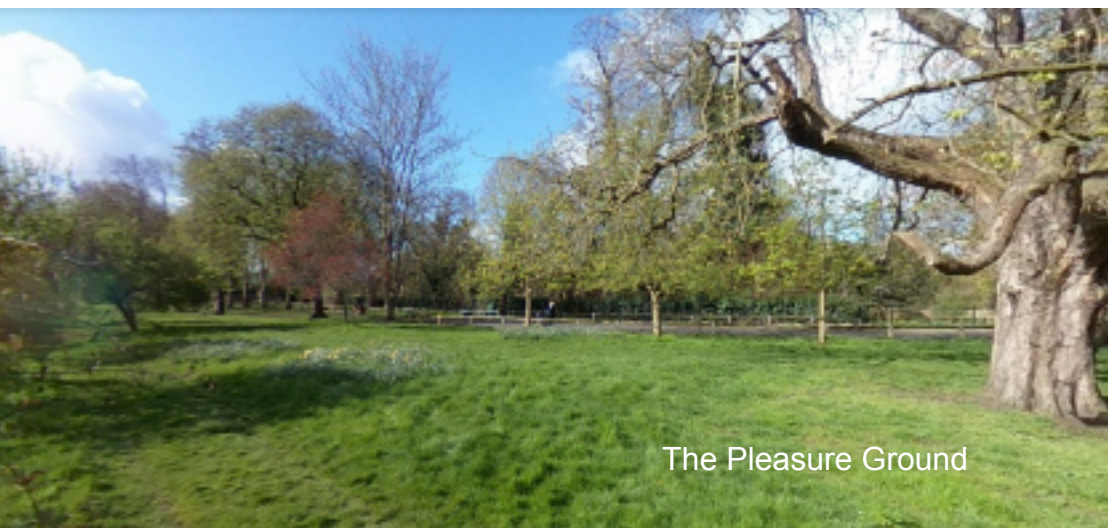
The Pleasure Ground