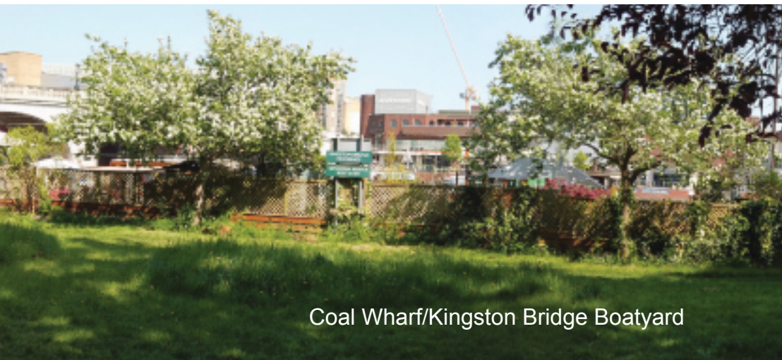
Coal Wharf/Kingston Bridge Boatyard