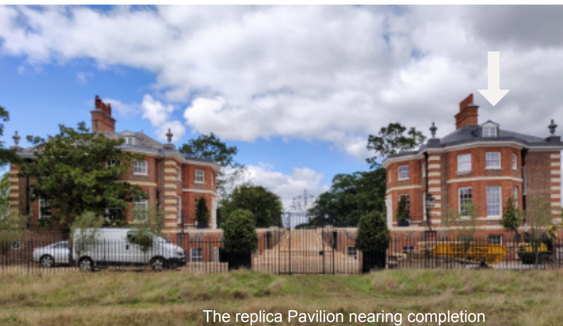
The replica Pavilion nearing completion

Once again it did not sell so the owners returned to the planning authority and successfully argued that the new Pavilion should be modelled on the existing design rather than the much smaller original. They got permission for this in 2014 with further additions being agreed in 2017. It went back on the market but was then withdrawn as the owners decided to redevelop it themselves. At the time of writing the entire project is now nearing completion ( below ).