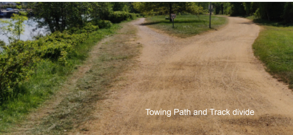
Towing Path and Track divide

Beyond this, the former meadow has become completely overgrown with a few major trees and widespread scrub. Eventually, near the beginning of the large island known as Raven's Ait, the meadow finally ends and the Bargeway begins to slowly open out again.