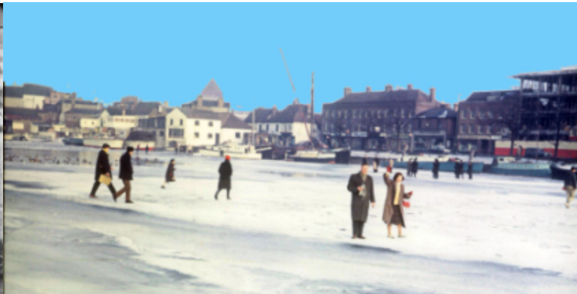
Below: The frozen river by the Minima Dinghy Park