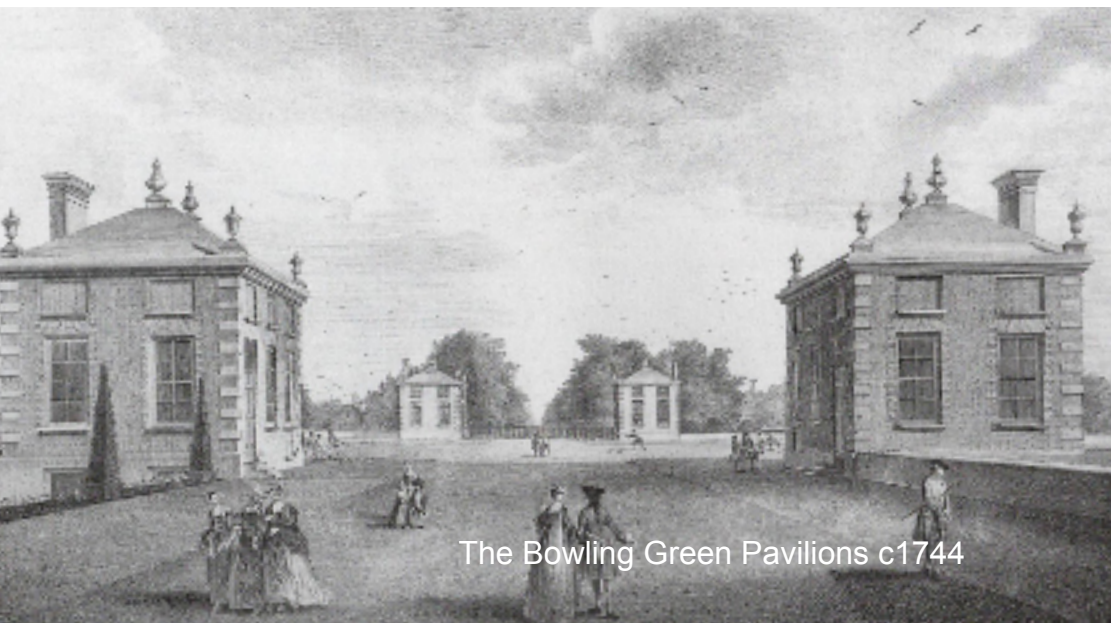
The Bowling Green Pavilions c1744

material recycled from the original Water Gallery. The demolition and subsequent construction of the terrace and bowling green pavilions was completed in just a year.