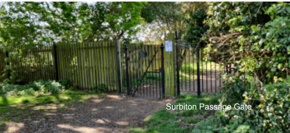
Surbiton Passage Gate