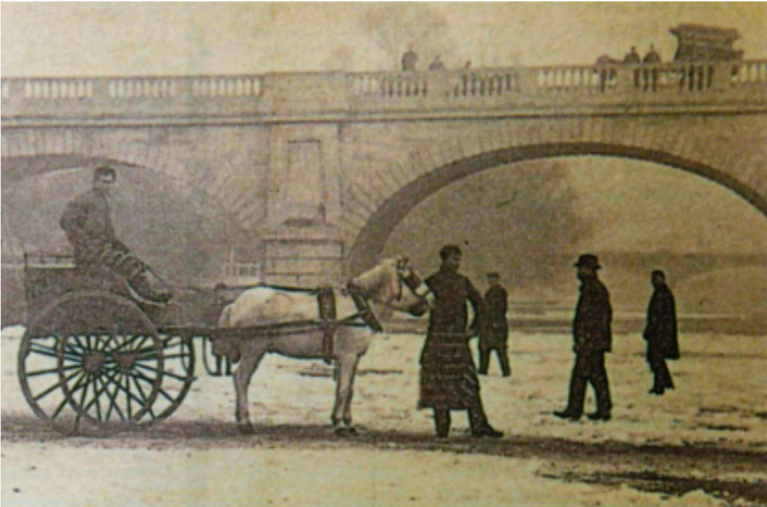
Above: A severe winter in 1894/95 caused the river to freeze at Kingston Bridge. Large numbers of local residents also took advantage of the excellent skating conditions on the Long Water in Home Park which had been opened to the public just the year before.