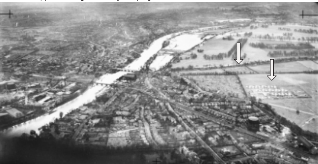
Below: This 1947 aerial photo shows that all the Barge Walk allotment ground and much of the Great Meadow are under water. Also clearly visible (and arrowed) are the still-intact WWII RAF Camp in Bushy Park and the horse paddock that was used for additional allotments to support the Dig for Victory campaign.

central London. From 1400 until the removal of the bridge in 1831, there were 24 winters in which the tidal Thames was recorded to have frozen over. The removal eliminated this quasi-barrage effect whilst the construction of the Albert, Victoria and Chelsea Embankments (1866 - 1874) meant the river now flowed faster through its significantly narrowed channel and it became still more difficult for ice to form. The last time the tidal Thames froze over completely was in 1814.