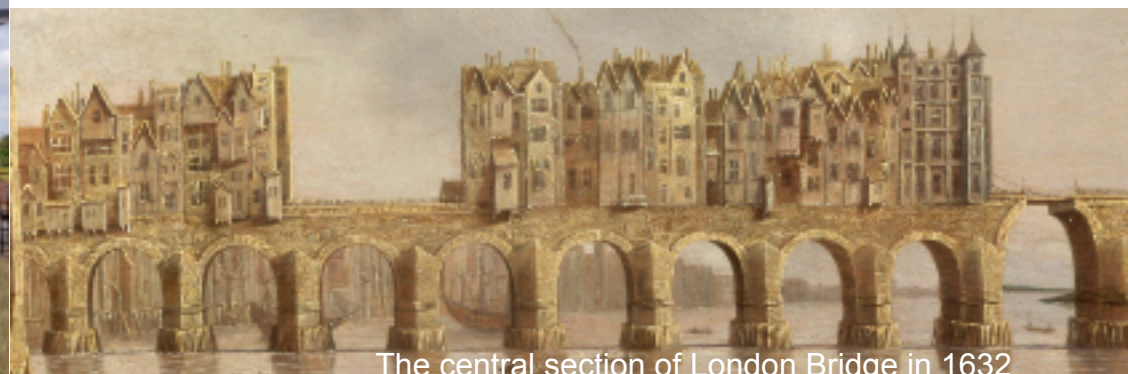
The central section of London Bridge in 1632