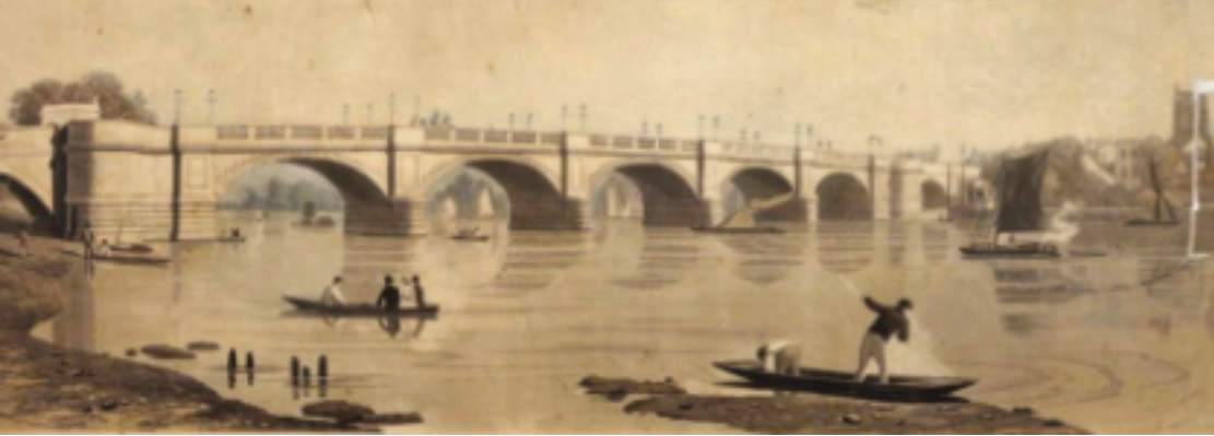
Top: Construction of Kingston Bridge nearing completion in 1827.