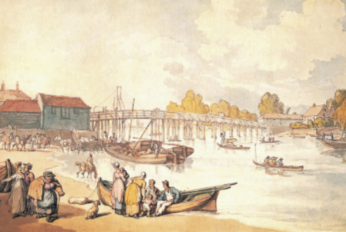
Above: The old bridge in the early 1800s. The shallowness of the river indicates that the artist Thomas Rowlandson created his picture before Teddington Lock had been completed in 1811.