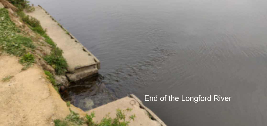
End of the Longford River