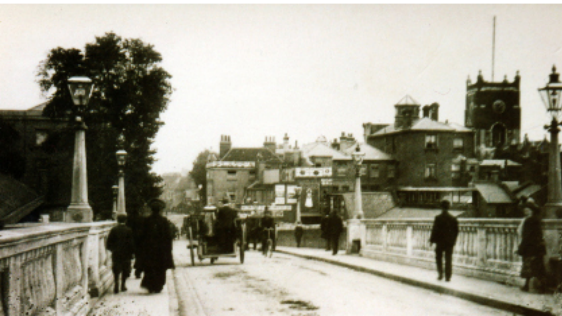
Below: The bridge around 1900.

In 1825 Kingston Corporation notified the Navigation Committee of the City of London that it intended to build a new bridge. An Act of Parliament was passed in the same year to authorise construction and the Trustees applied to the Exchequer Bill Loan Commissioners 12 for £45,000 funding (almost £200m at today's values).