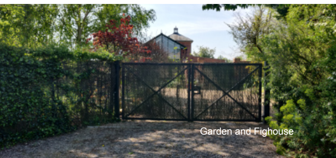
Garden and Fighouse

The Wilderness Estate was owned until WWII by the Corporation of the City of London and its successor as the river management authority Thames Conservancy. The two principal houses are The Wilderness (page 83) and Parkfield (page 85). Between them are the original twinned coach houses/stables that later became staff cottages. One is almost unchanged whilst the other has now morphed into a five-bedroom house.