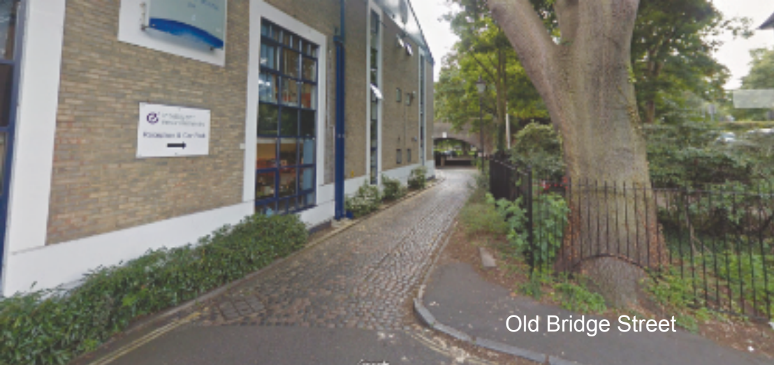
Old Bridge Street